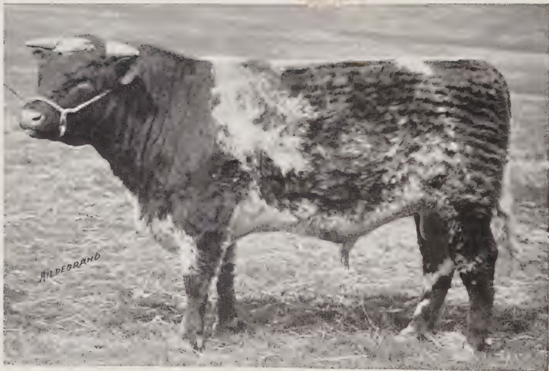
SULTAN SUPREME 367161.